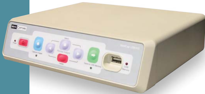
MediCap™ USB 100 Captures digital images from analog medical imaging devices

T he MediCap USB100 easily captures digital images from medical imaging equipment such as ultrasounds, endoscopes, intraoral cameras, surgical microscopes, and most video imaging devices.